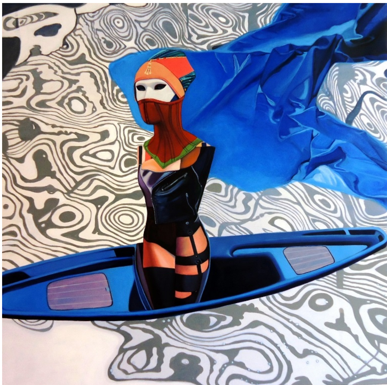
Title: Drunken boat Size: 100x100cm Media: oil and acrylic on canvas Year: 2015