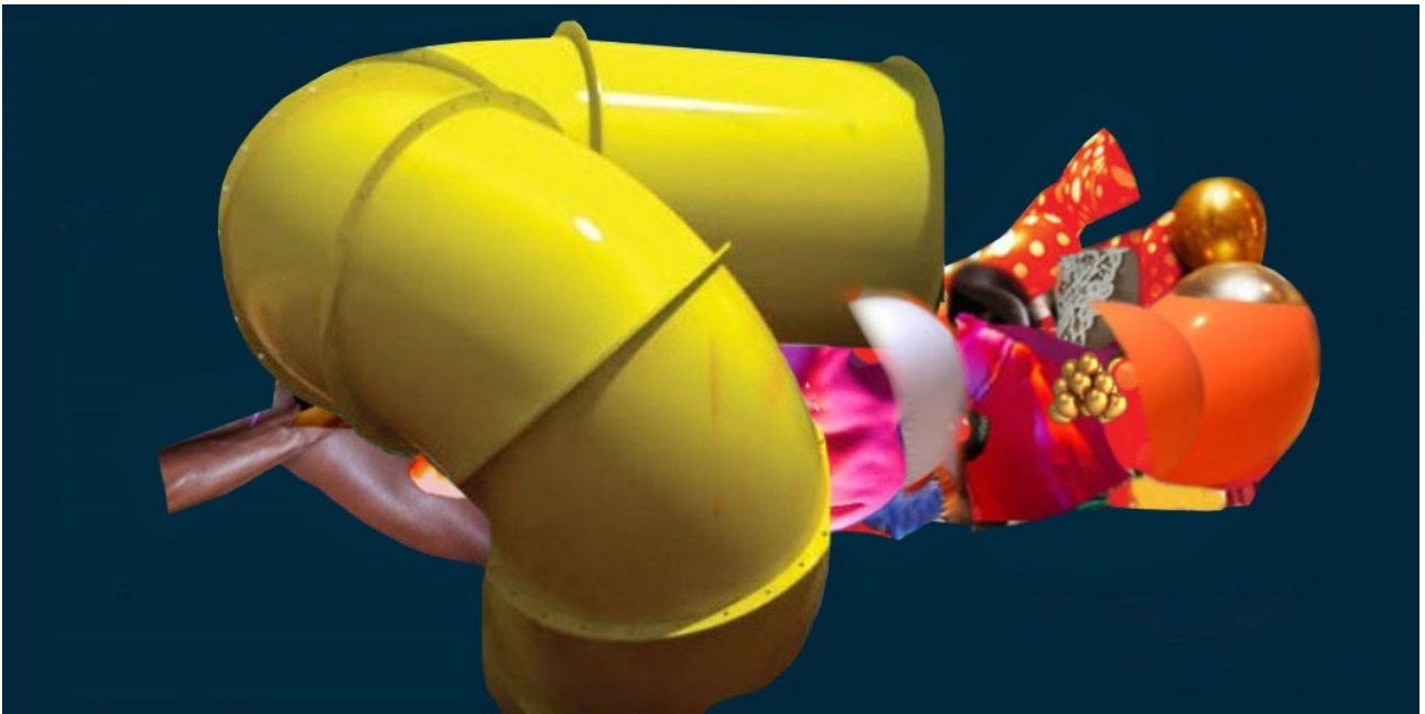
Title: magnificent gen Size: 200x100cm Media: oil and acrylic on canvas Year: 2015