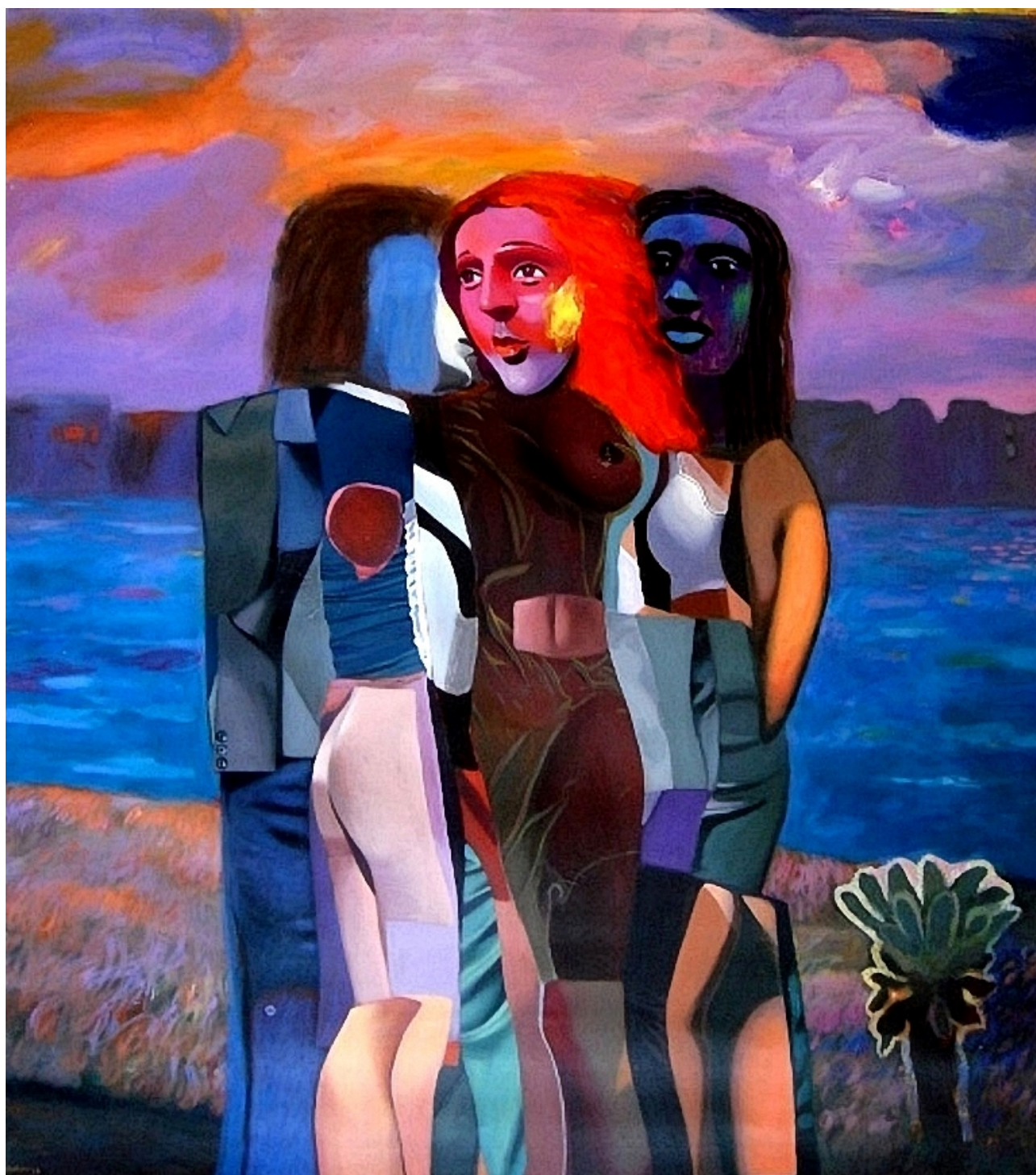
Title: at the dawn Size: 120x130cm Media: oil and acrylic on canvas Year: 2001