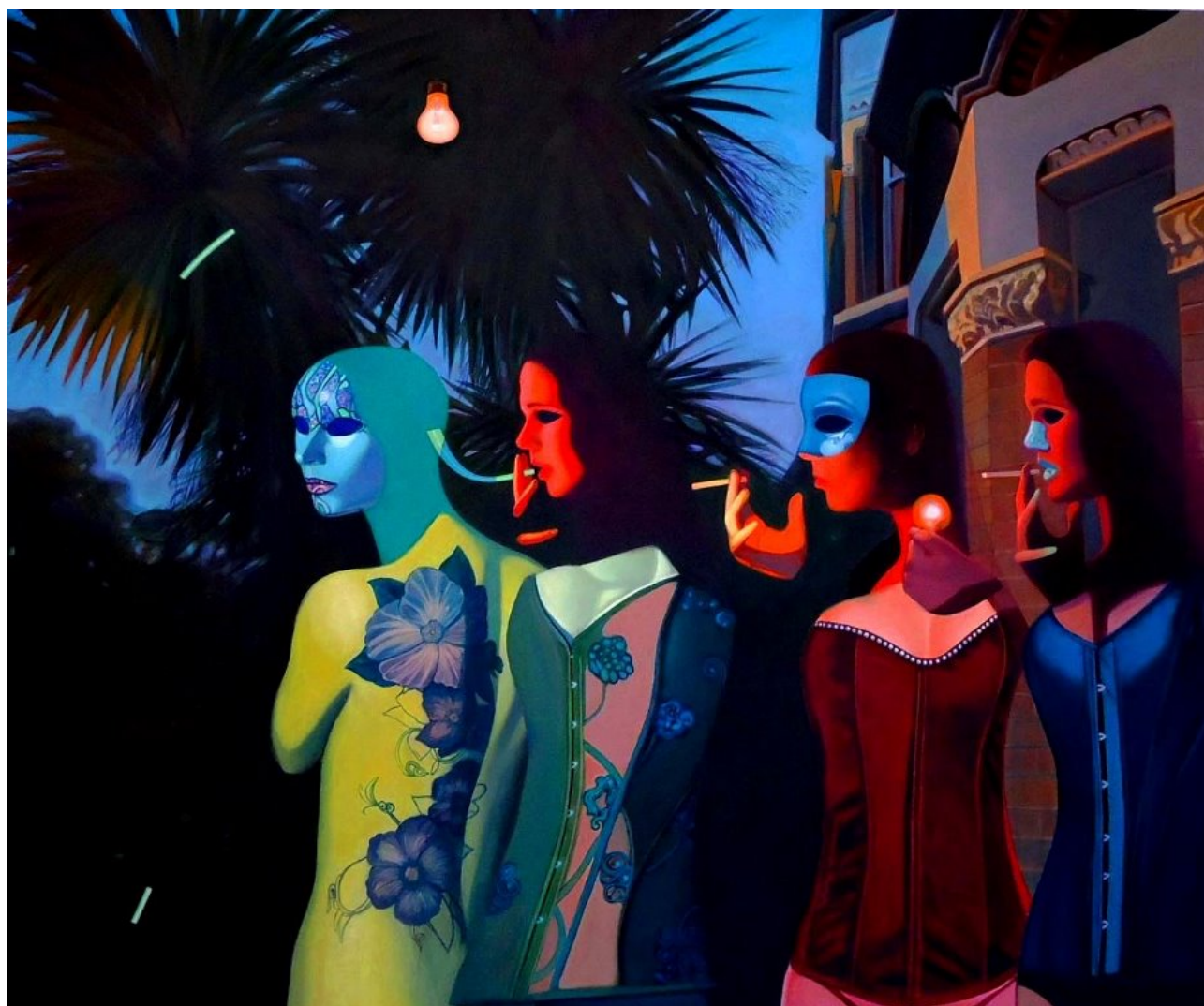
Title: out of myself Size: 100x120cm Media: oil and acrylic on canvas Year: 2015