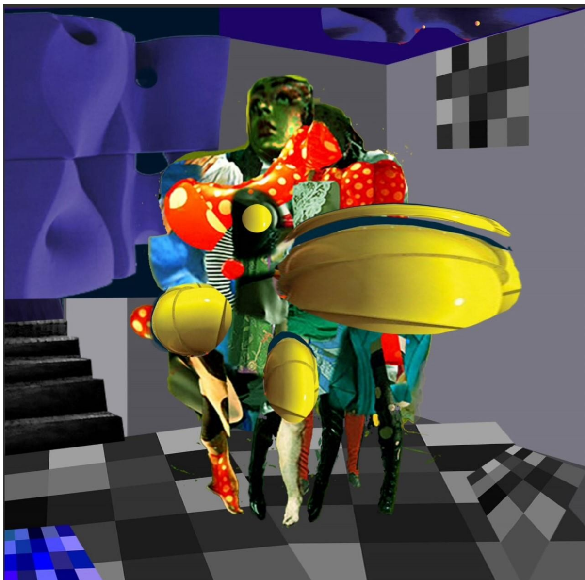
Size: 200x200cm Media: acrylic on canvas Date: 2022