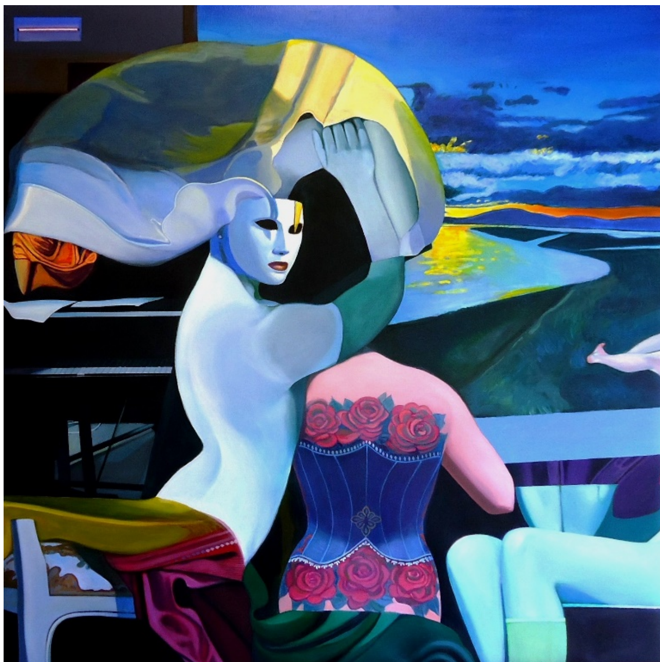
Title: Jazz sense Size: 100x100cm Media: acrylic on canvas Year: 2014