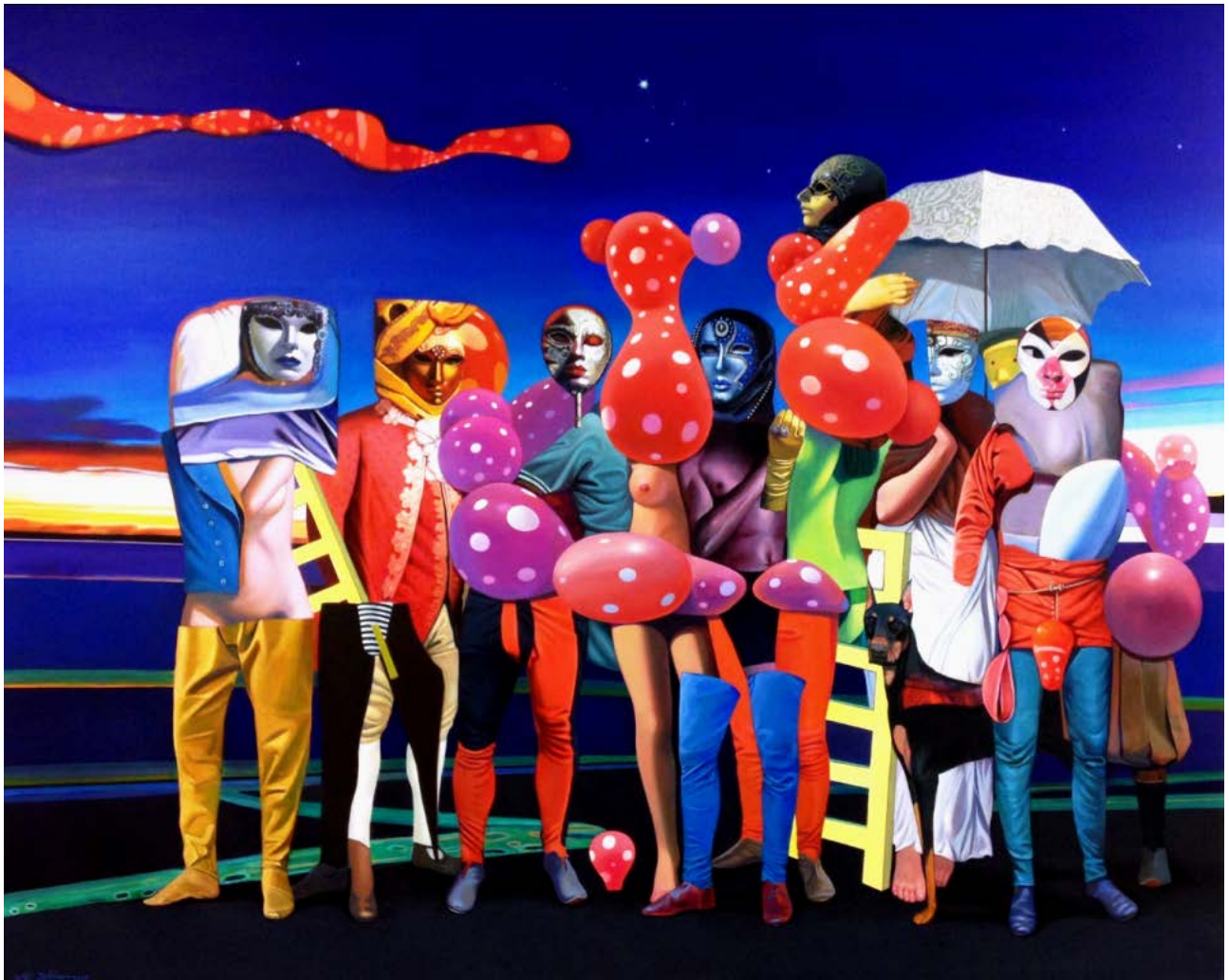
Title: Where are we from & where are we? Size: 250x200cm Media: oil and acrylic on canvas Year: 2015