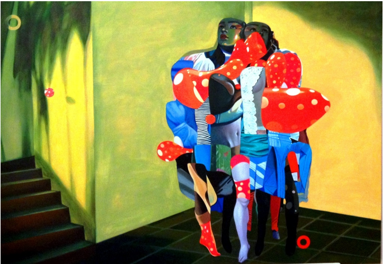
Title: in the corner Size: 170x120cm Media: oil and acrylic on canvas Year: 2015