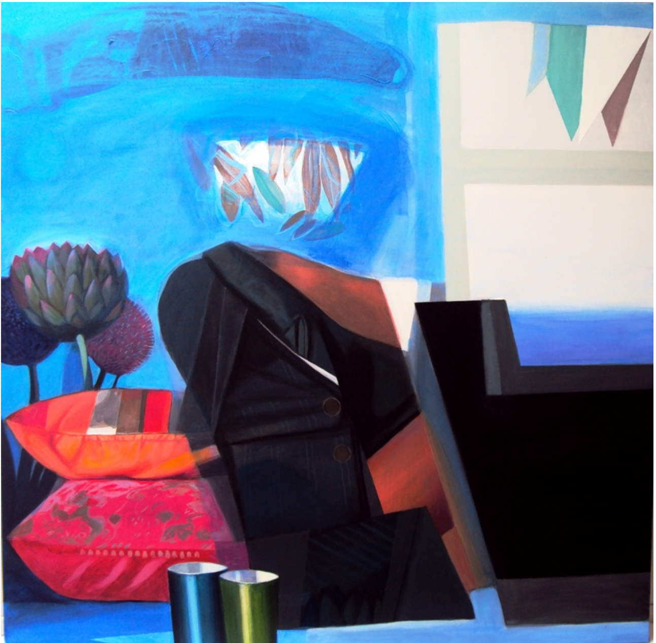
Title: bright passed days Size: 100x100cm Media: oil and acrylic on canvas Year: 2008