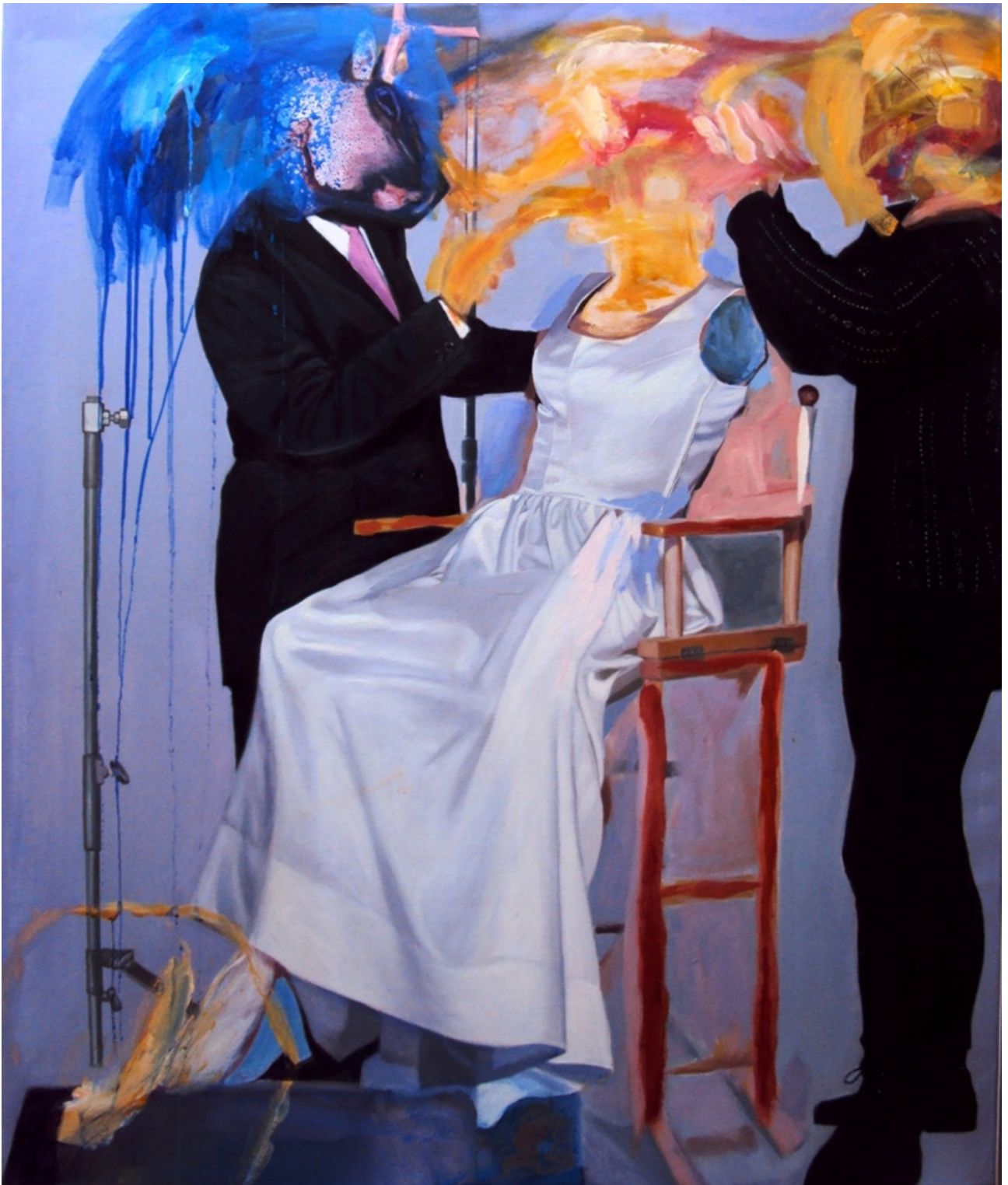
Title: boarding desiccation Size: 100x120cm Media: oil and acrylic on canvas Year: 2000