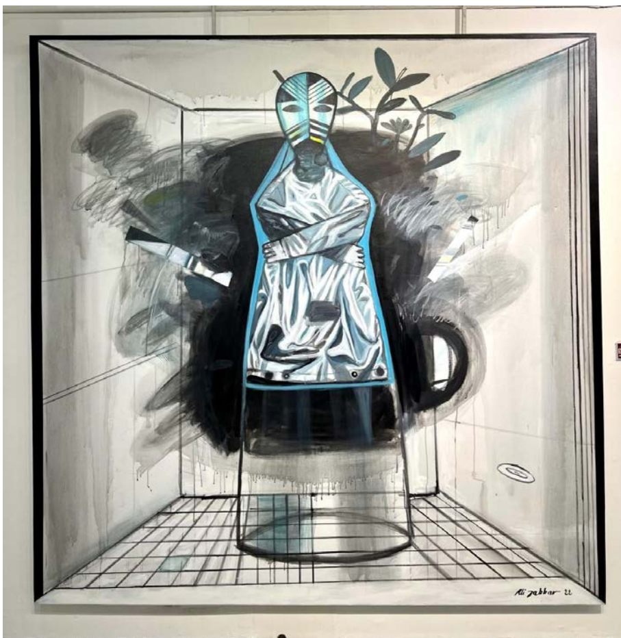
Size: 200x200cm Media: acrylic on canvas Date: 2022