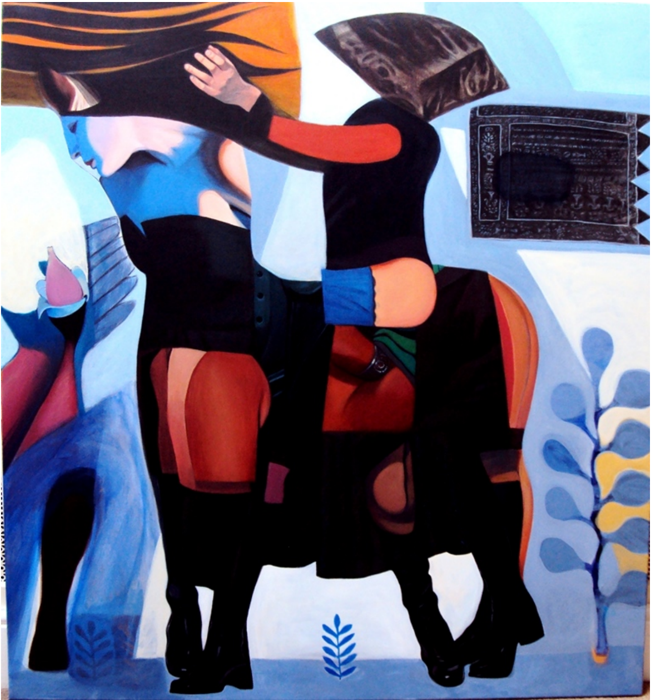
Title: roles ex. change Size: 120x130cm Media: oil and acrylic on canvas Year: 2005