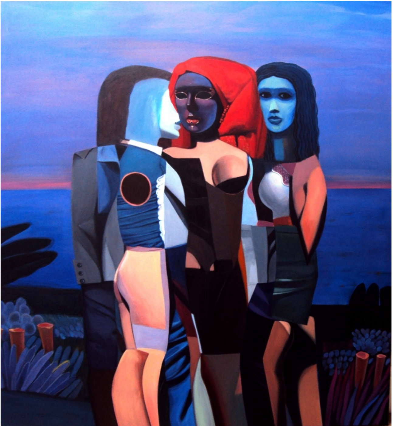
Title: at the sunset Size: 120x130cm Media: oil and acrylic on canvas Year: 2010