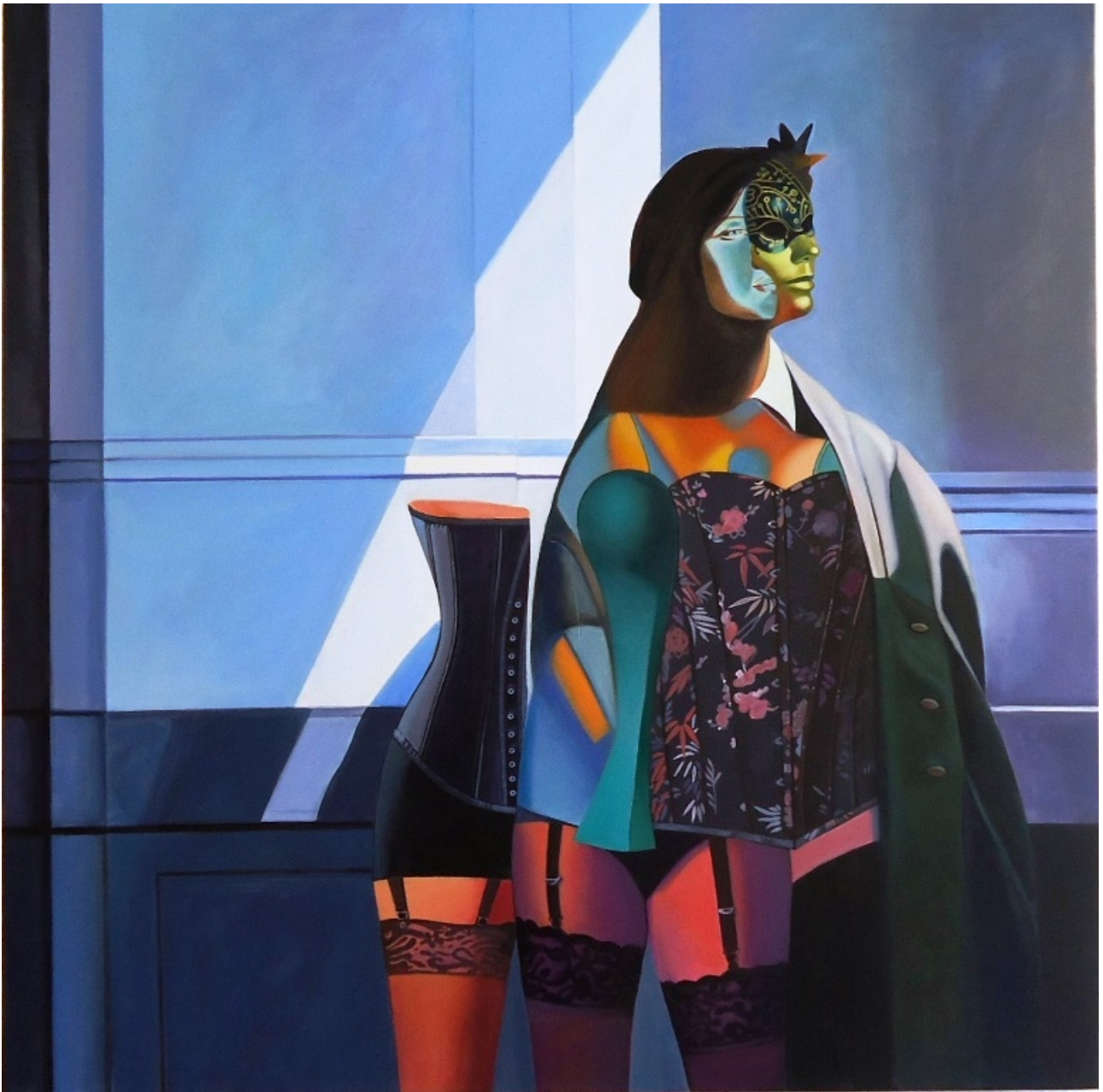
Title: Digital sun light Size: 100x100cm Media: oil on canvas Year: 2015