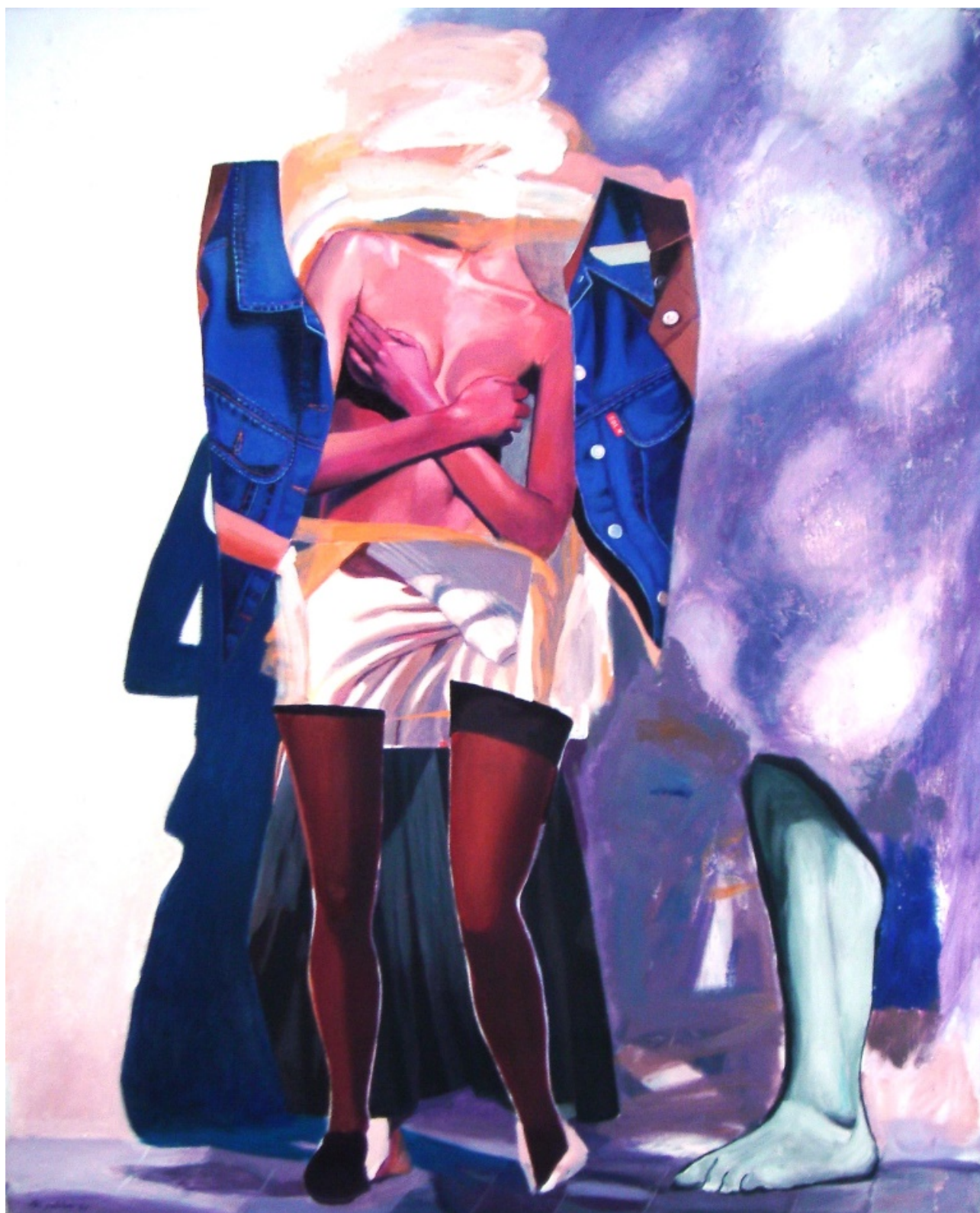
Title: loose desire Size: 100x120cm Media: oil and acrylic on canvas Year: 2000