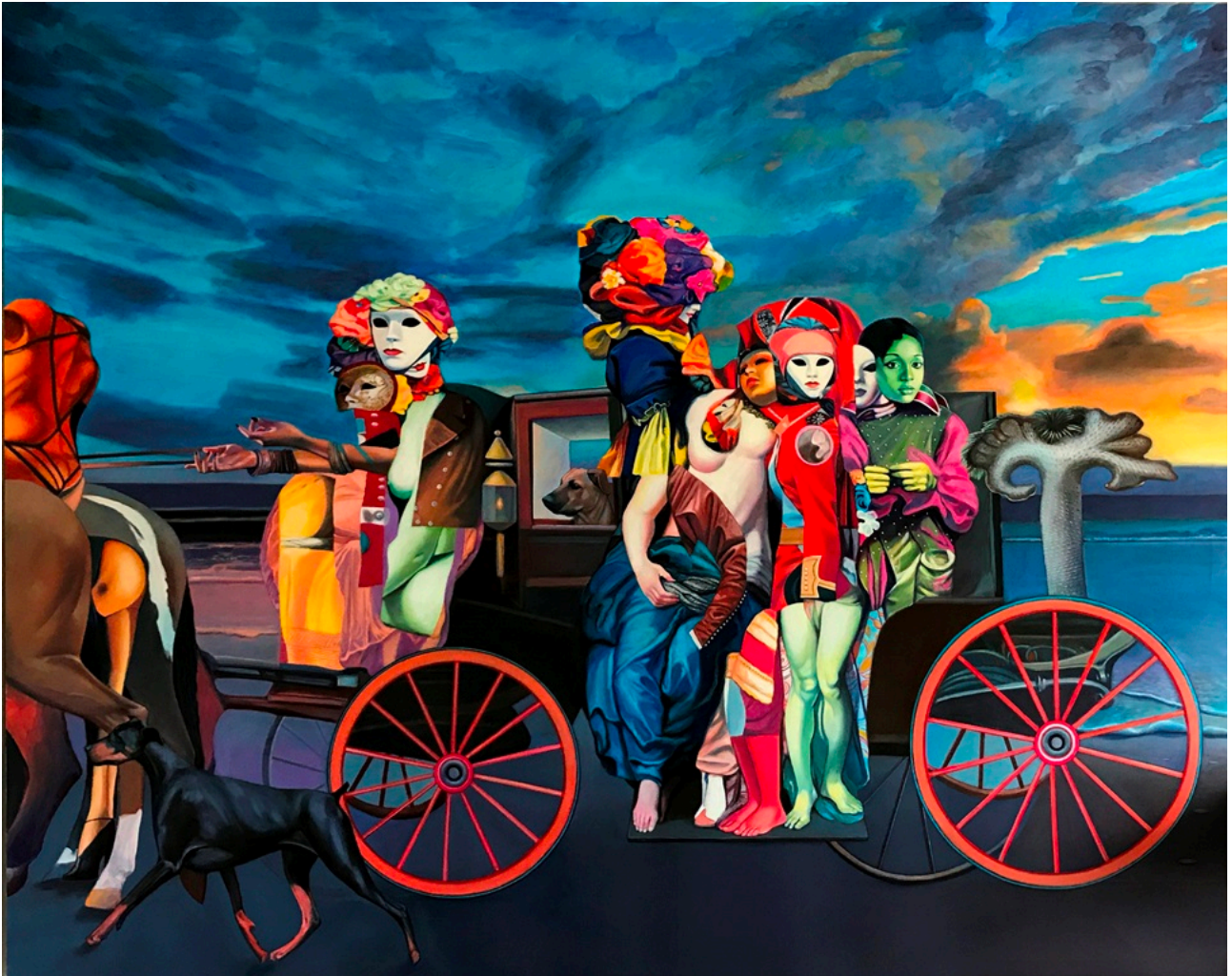
Title: Where are we going? Size: 250x200cm Media: oil and acrylic on canvas Year: 2016